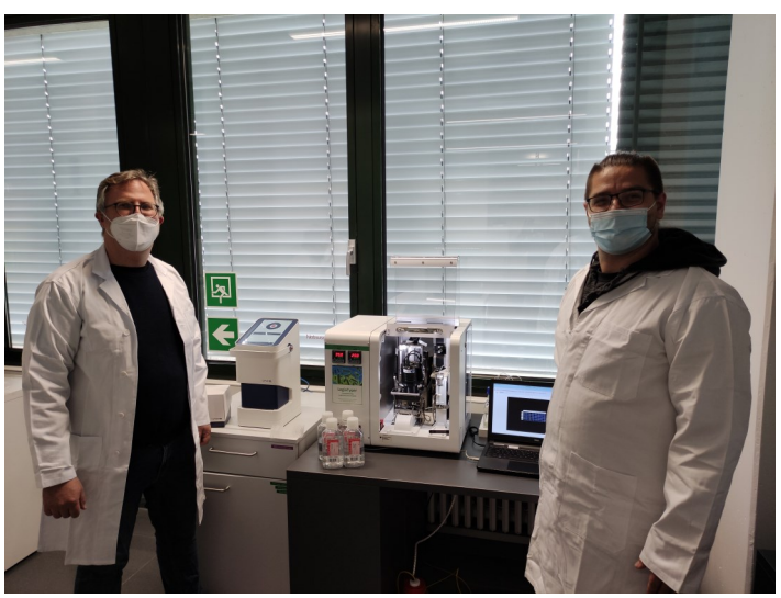
ramicro.COUNT installed at Technical University of Munich at the start of the VDI project in 2020

partners on the WIPANO – LegioRapid – project. Watch the webinar recording for more insights.